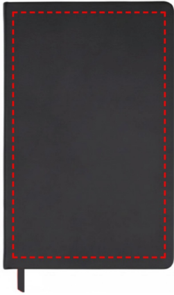
FRONT - FULL SIZE