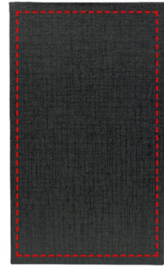
TOP OF THE BOX